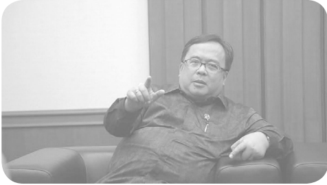
Professor Bambang Permadi Soemantri Brodjonegoro, SE., MUP., PhD.

Minister of National Development Planning, Indonesia